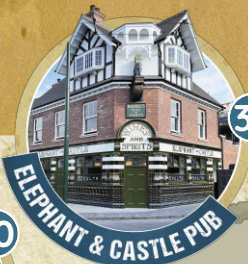
34 ELEPHANT & CASTLE PUB