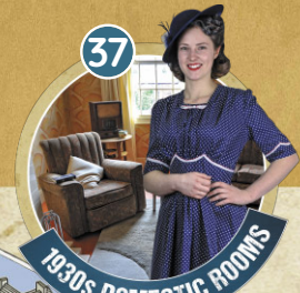
37 1930S DOMESTIC ROOMS