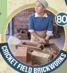
80 CRICKET FIELD BRICKWORKS