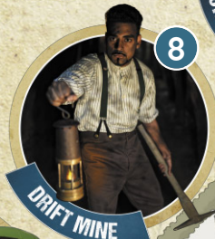
8 DRIFT MINE