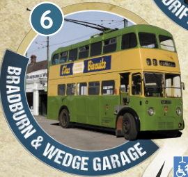
6 BRADBURN & WEDGE GARAGE

Please ask for a free access map from visitor reception or view online: bclm.com/access