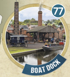
77 BOAT DOCK